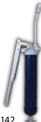
#1142 Lincoln Lever Grease Gun